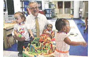
PEDIATRIC UNIT FUN: Thanks to grants totaling more than $17,000, The Hospital for Special Care, New Britain, CT, established the "Garden of Hope," a special play area for children hospitalized in the pediatric unit.

Contributors to the area, known as the "Garden of Hope," include Cherish the Children Foundation, Ronald McDonald Charities of Connecticut & Western Massachusetts and private donors. ■